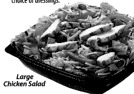
Large Chicken Salad

Greek Salad — Black olives, red onions, mild banana peppers, Roma tomatoes and feta cheese. Served with croutons and choice of dressings.